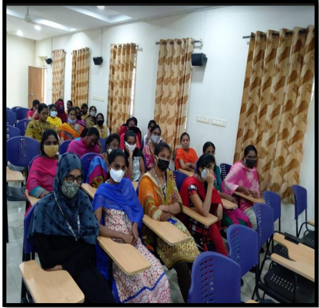
Students listening to the Seminar